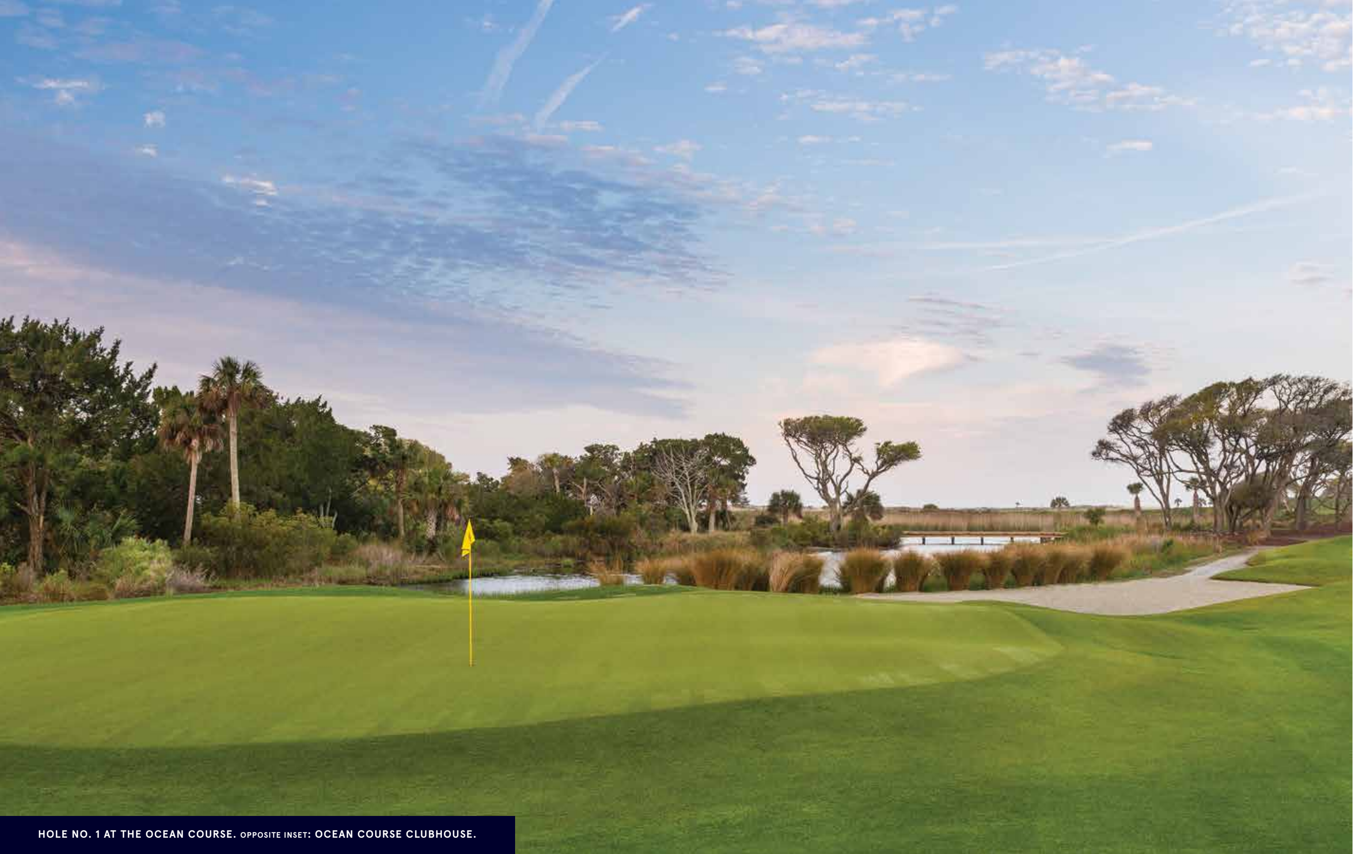
HOLE NO. 1 AT THE OCEAN COURSE. OPPOSITE INSET: OCEAN COURSE CLUBHOUSE.