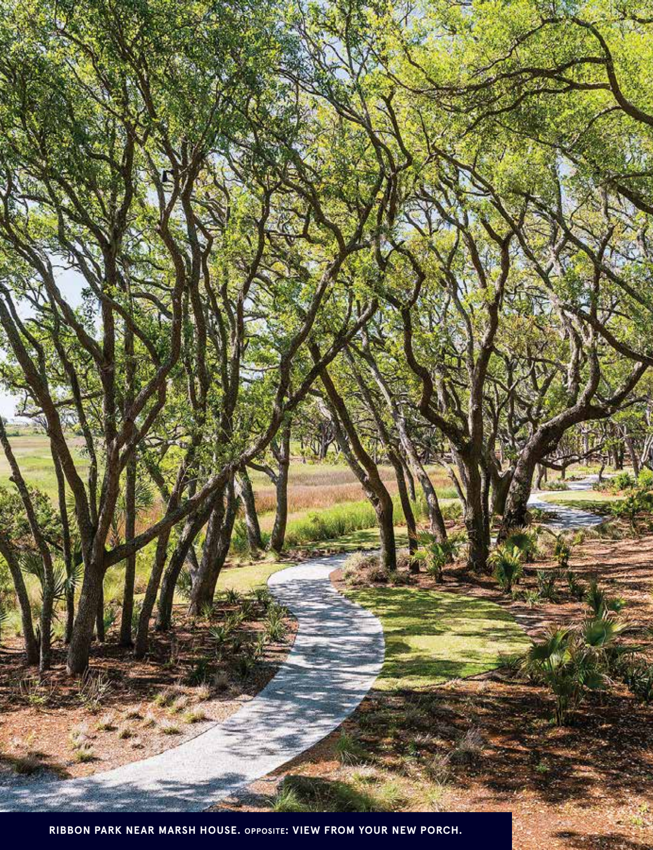
RIBBON PARK NEAR MARSH HOUSE. OPPOSITE: VIEW FROM YOUR NEW PORCH.