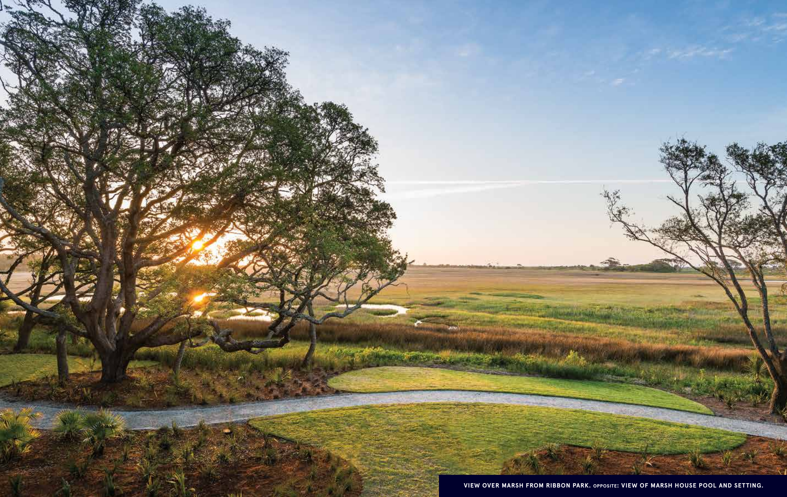
VIEW OVER MARSH FROM RIBBON PARK. OPPOSITE: VIEW OF MARSH HOUSE POOL AND SETTING.